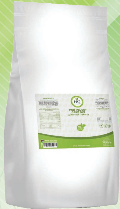
RED VELVET CAKE MIX