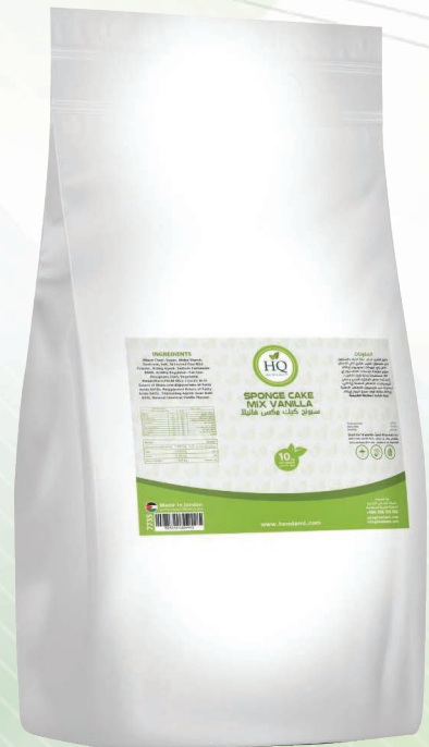
SPONGE CAKE MIX VANILLA