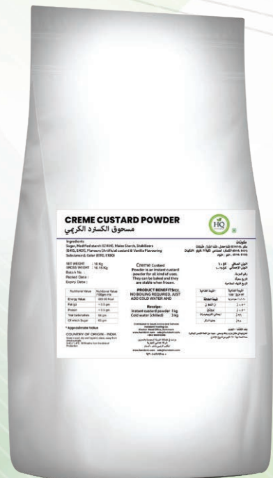
CREME CUSTARD POWDER