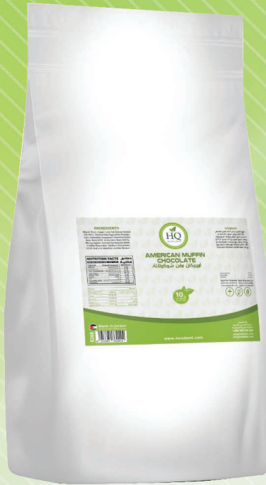
AMERICAN MUFFIN CHOCOLATE