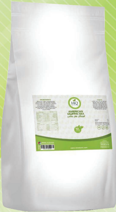
AMERICAN MUFFIN MIX