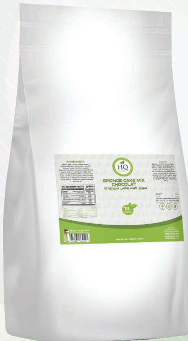
SPONGE CAKE MIX CHOCOLATE