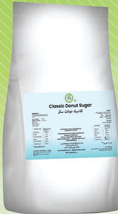
CLASSIC DONUT SUGAR